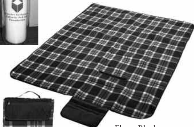
Fleece Blanket $20.00

Are you wanting a meaningful way to engage your students in coming to know Jesus better? Use this locally created and produced musical stage production to tell the story of our Lord, Jesus Christ. The Performance Kit ($75.00) includes script, musical notation, instrumental CD and CD. For more information about Who Is This Jesus Man? click on the link at www.gscs.sk.ca/foundation or contact the Foundation.