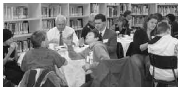
A nutritious lunch preceded the draws for the 26 prizes.