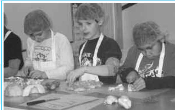
Students from St. Mark School and Oskāyak High School are learning food preparation skills through the Kids Kitchen Program.