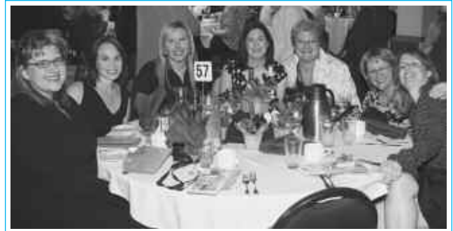
The gals from St. Dominic School always have fun.

whose enthusiasm and dedicated work ethic contributed to such an extraordinary evening. With the support of all of our valued donors, the Foundation is able to provide growth in leadership opportunities to hundreds of our students. ■