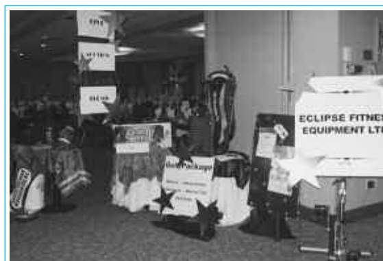
These live auction items had many guests raising their hands in support of student programs.