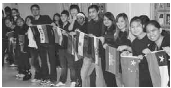
E.D. Feehan High School students display the flag of their country of origin at a recent press conference which announced a major financial initiative for the school.