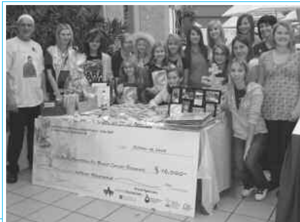
The Ya Ya Sisterhood at St. Luke School raised $16,000.00 for the C95 Radiothon for Breast Cancer Research through the sales of their book "Celebrate Changes - Girls' Voices Matter."