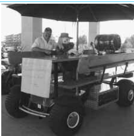
This unique BB Buggy ferried golfers to the putting green.