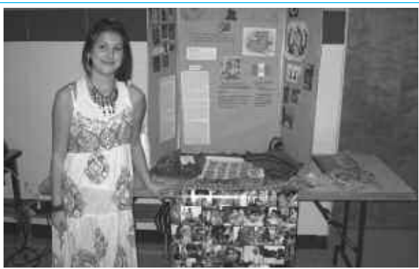
Visitors to the grade 6/7 Folkfest at Georges Vanier Catholic School learned all about life in Guatemala.