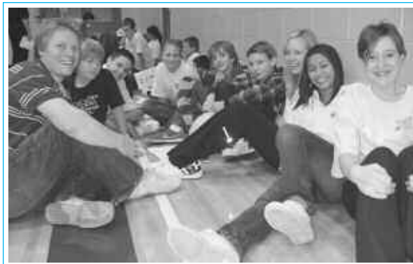
The St. Angela group are doing their homework at the Student Leadership Conference held on October 8/9, 2008.