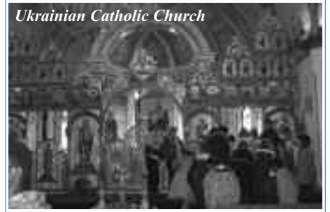
Ukrainian Catholic Church

The Grade 8 students at St. Mark School had the opportunity to visit several places of worship as part of their Social Studies unit on World Religions. Students learned about worship in a Hindu temple, a synagogue, a Mosque, a Buddhist temple and in a Ukrainian Catholic church.