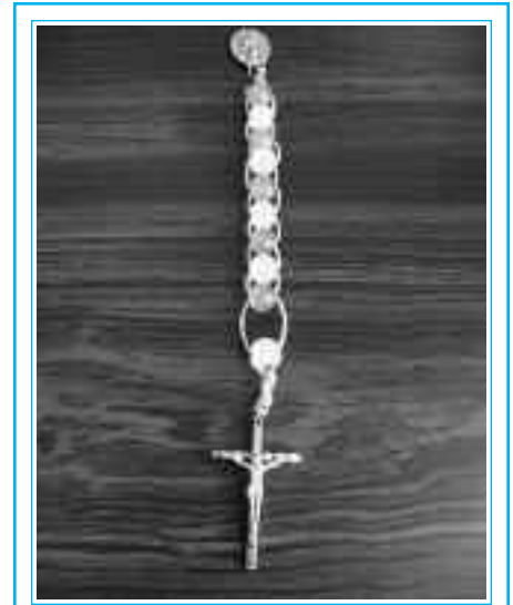
Sacrifice beads made by Rosary Club members from St. Bernard School.

Participants eagerly share the benefits that they have experienced by being part of a Rosary Club – feeling peaceful, feeling safe, the forming of a special bond within the group and finding comfort in knowing that others are praying for them.