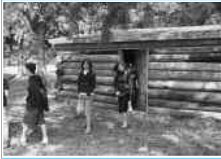
Grade 8 students from St. Augustine, Humboldt toured St. Peter's Abbey during their retreat.